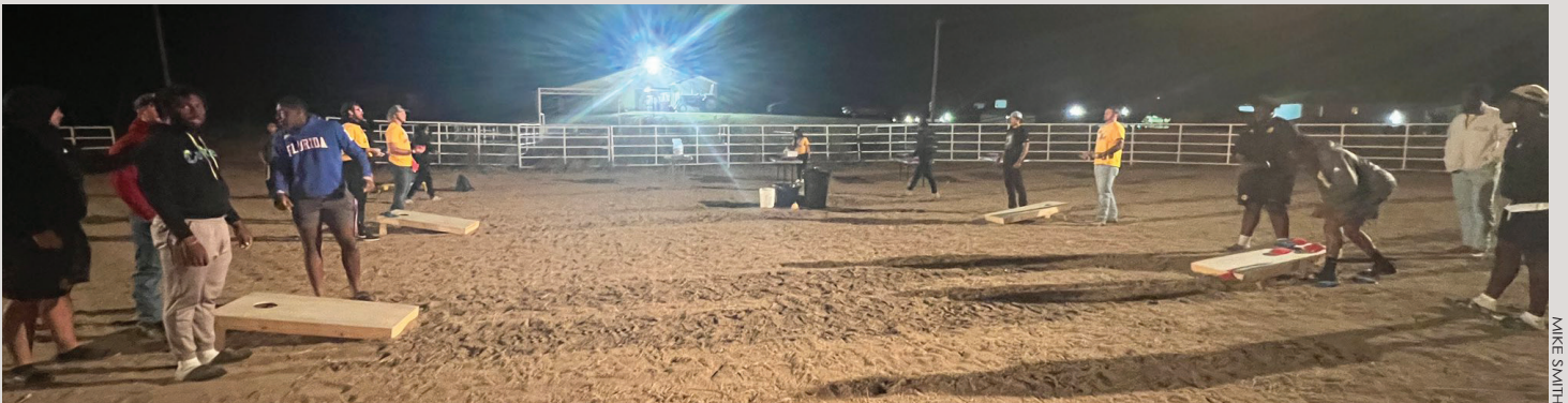
In addition to the bonfire and pep rally on Oct. 14, students also enjoyed playing games, such as corn hole and cup pong.