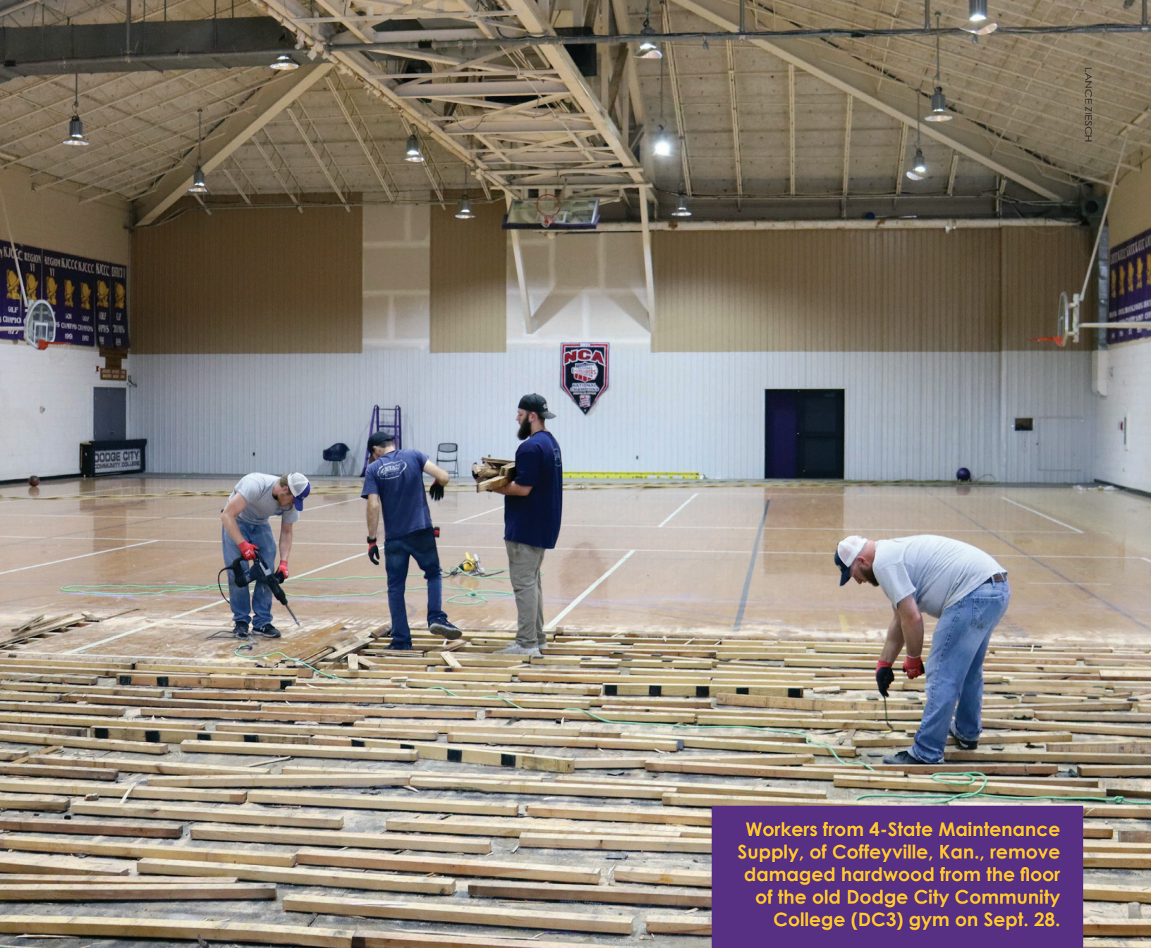
Workers from 4-State Maintenance Supply, of Coffeyville, Kan., remove damaged hardwood from the floor of the old Dodge City Community College (DC3) gym on Sept. 28.