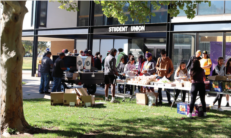
With a theme of “Go Gold or Go Home,” the DC3 Homecoming Week was filled with activities, such as an Oct. 13 cookout on the quad, with hamburgers and hot dogs grilled by Black Hills Energy.