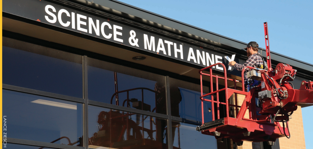
A worker from Miracle Signs installs new lettering on the east end of the Science & Math Annex on Sept. 27.