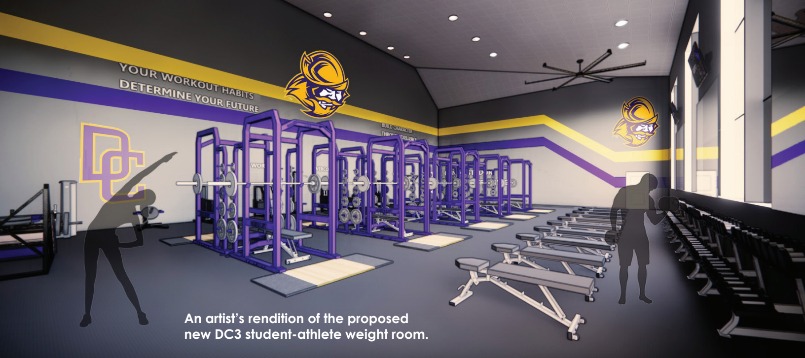
An artist's rendition of the proposed new DC3 student-athlete weight room.