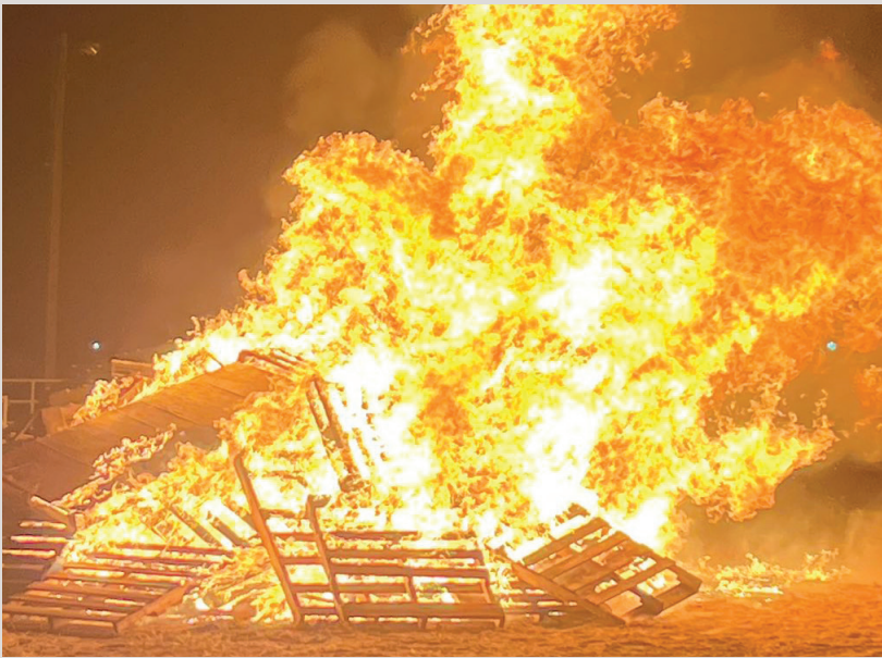
This year, the homecoming bonfire took place in the rodeo practice arena, on the west side of campus, on the evening of Oct. 14.