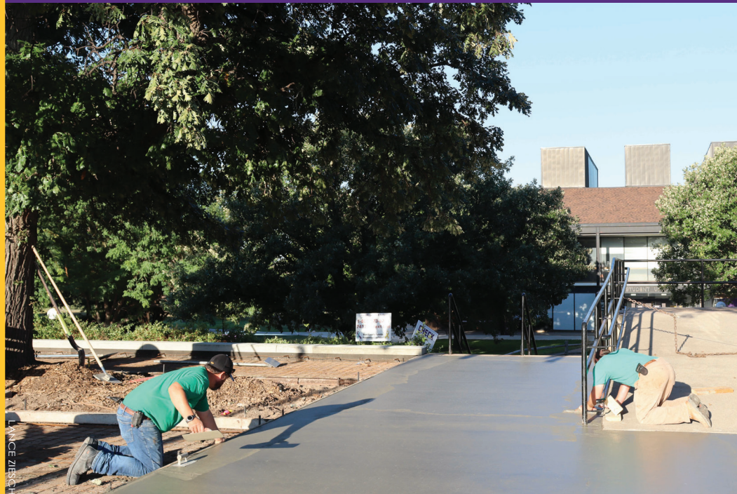
Workers from Brak-Hard Concrete smooth freshly poured cement near the southeast corner of the Science & Math building on Aug. 24.