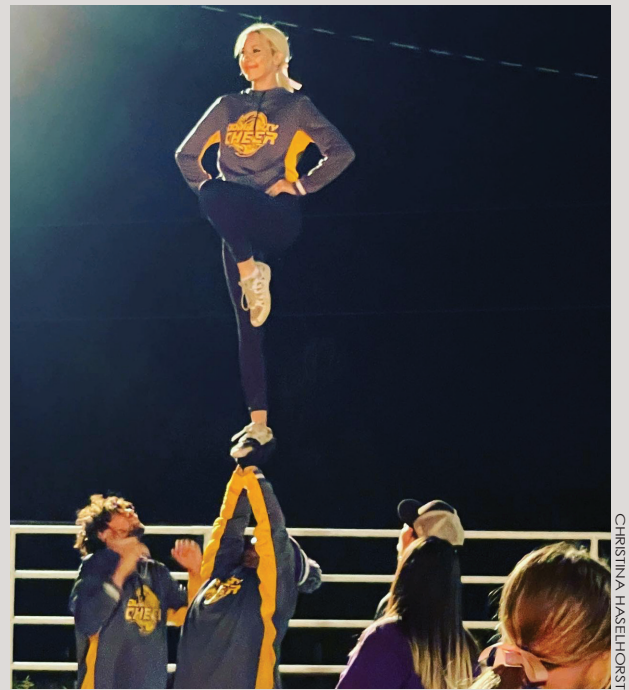
As in past years, the pep rally at the bonfire site was led by the DC3 cheerleaders.