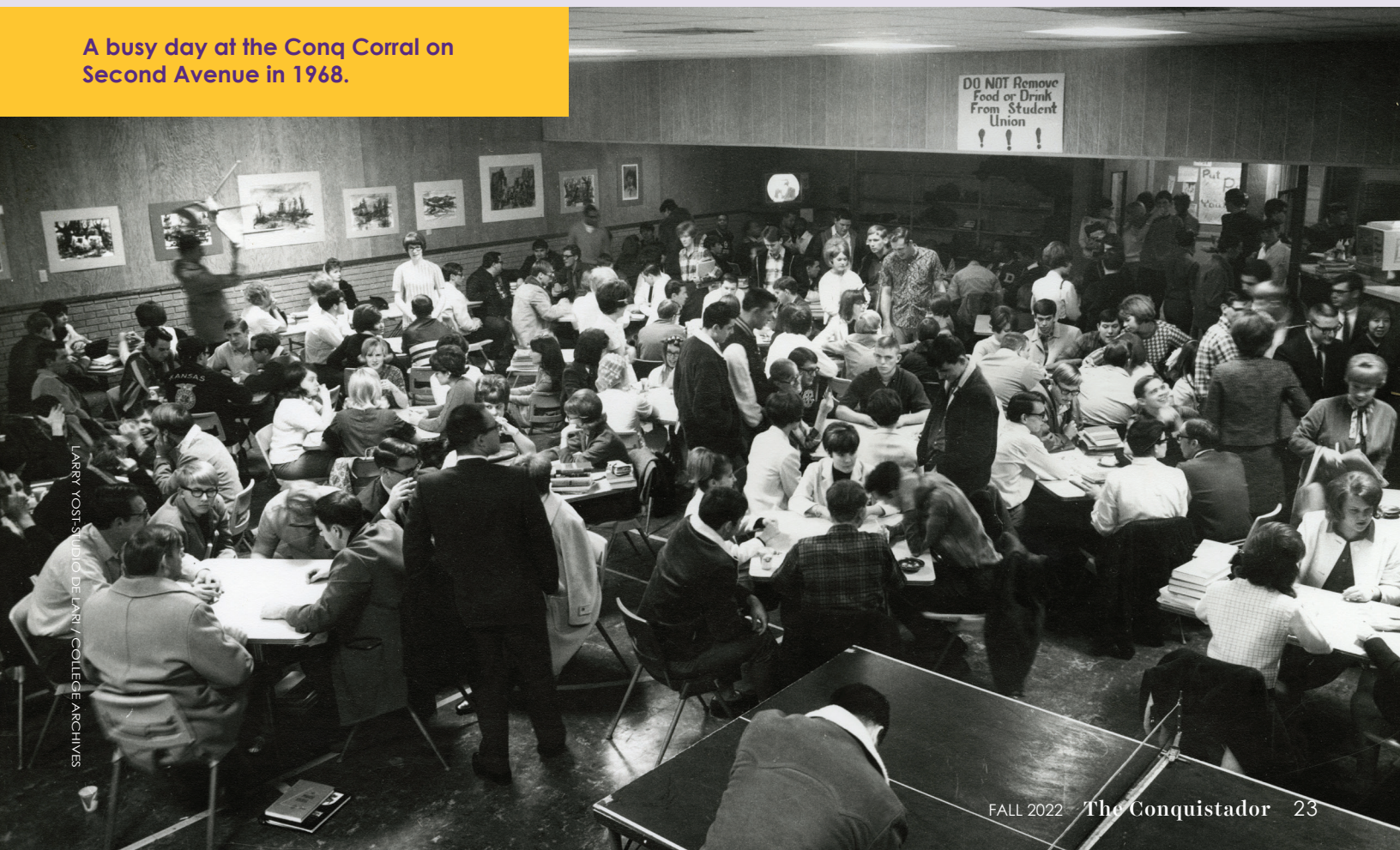
A busy day at the Conq Corral on Second Avenue in 1968.