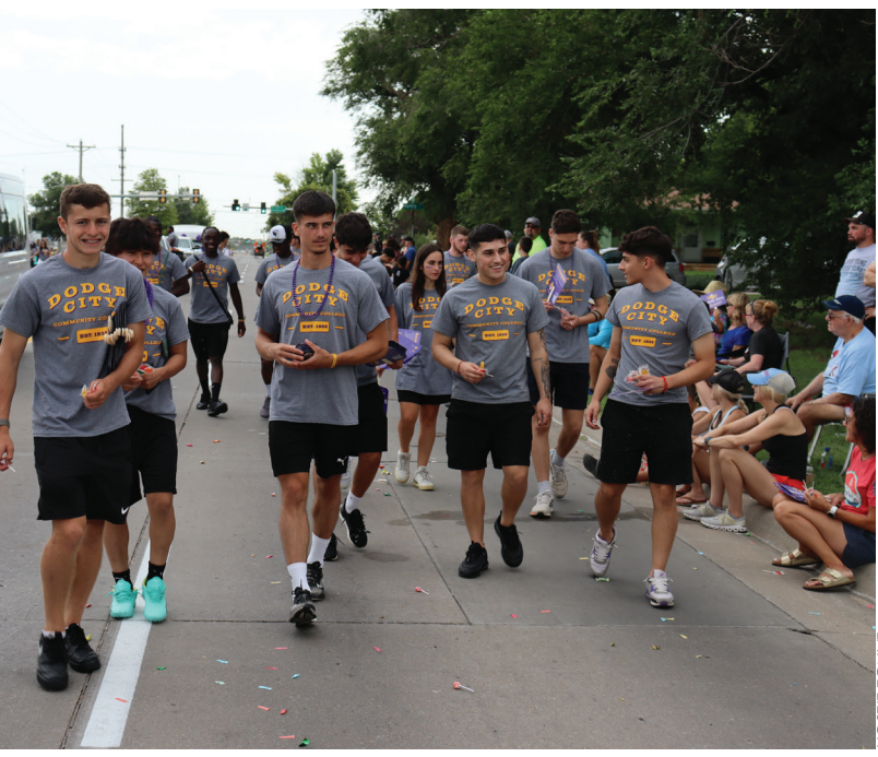
Approximately 170 DC3 students, administration, faculty, and staff participated in the 2023 Dodge City Days Western Parade on July 29. Several college vehicles—including entries from TRIO Student Support Services and the Hispanic American Leadership Organization (HALO)—joined the college's nearly block-long lineup. In addition, student-athletes and coaches representing the men's basketball, football, rodeo, track and field, and men's and women's soccer teams—as well as representatives from the college's Advising, Foundation, Marketing, Nursing, Security, and Transportation departments—took part in the festivities.