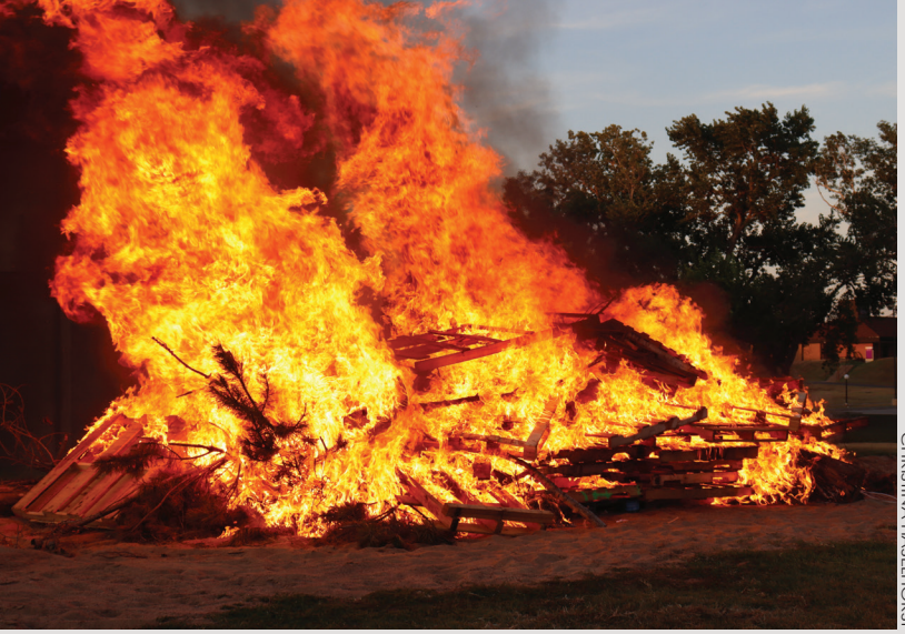
This year, the Homecoming bonfire took place on the sand volleyball pit behind Jackson Hall, on the evening of Sept. 29.