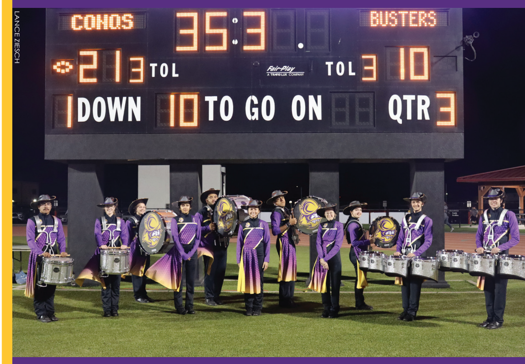
The ConquistaCorps drumline performed at halftime of the Homecoming game on Sept. 30 at Memorial Stadium.

The new marching band uniforms are comprised of a jacket, bibbers (overalls), a hip cape, and an Aussie hat.