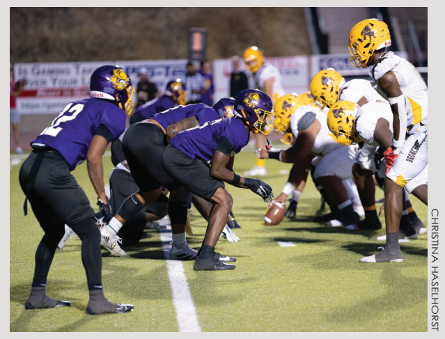
For the first time since 2015, the Conq football team claimed victory against Garden City, defeating the Broncbusters 33-10.