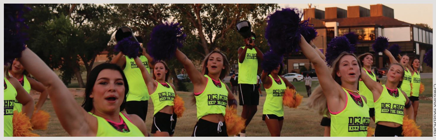
As in past years, the pep rally at the bonfire site was led by the DC3 cheerleaders.