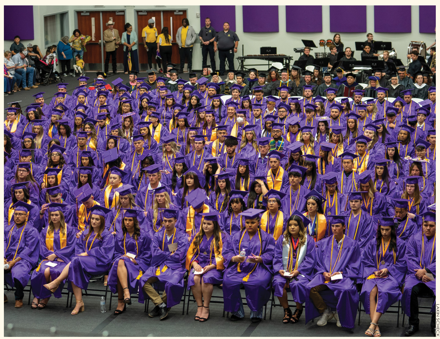
Members of Dodge City Community College's 87th graduating class wait to receive their diplomas on May 13, in the DC3 Student Activity Center.