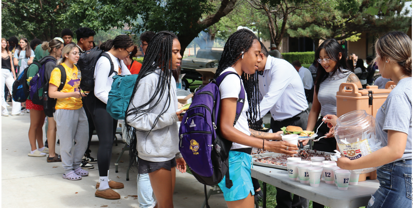
As part of the 2023 Hispanic Heritage Week, Sept. 18-22, the DC3 Hispanic American Leadership Organization (HALO) club sponsored a free cookout on Sept. 21 on the college quad. The menu featured hamburgers and hot dogs, grilled by employees of Black Hills Energy, and Mexican street corn, potato salad, chips, brownies, and drinks, prepared by Great Western Dining. The week's festivities culminated with the Fiesta, Don't Siesta Dance, in the Old Gym, on Sept. 22.