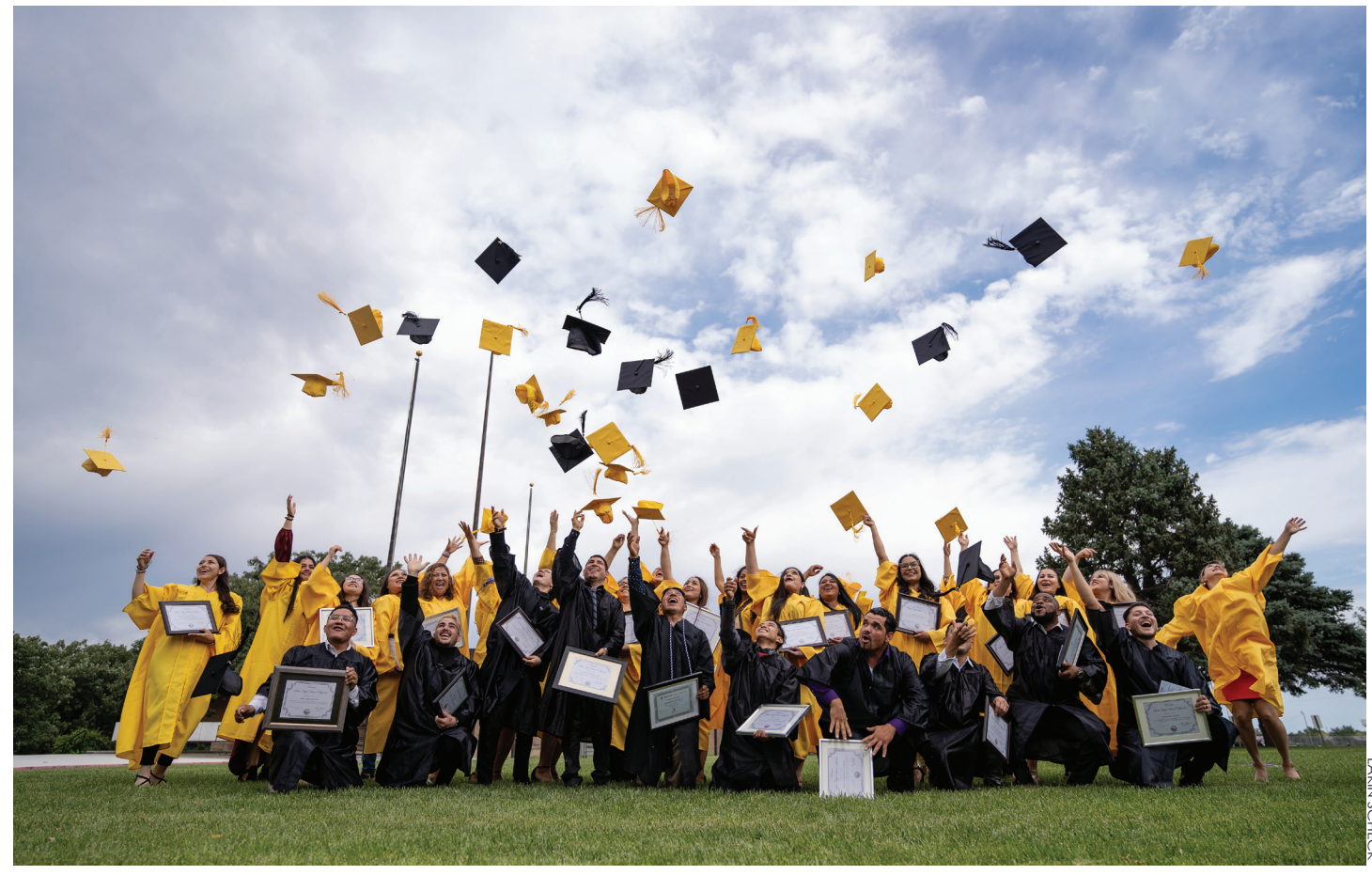
The DC3 Adult Learning Center (ALC) hosted its Class of 2023 graduation ceremony at 10 a.m., on June 30, in the DC3 Little Theatre. A total of 34 students received high school diplomas, although not all were in attendance. Following the ceremony, the graduates celebrated by throwing their caps into the air.