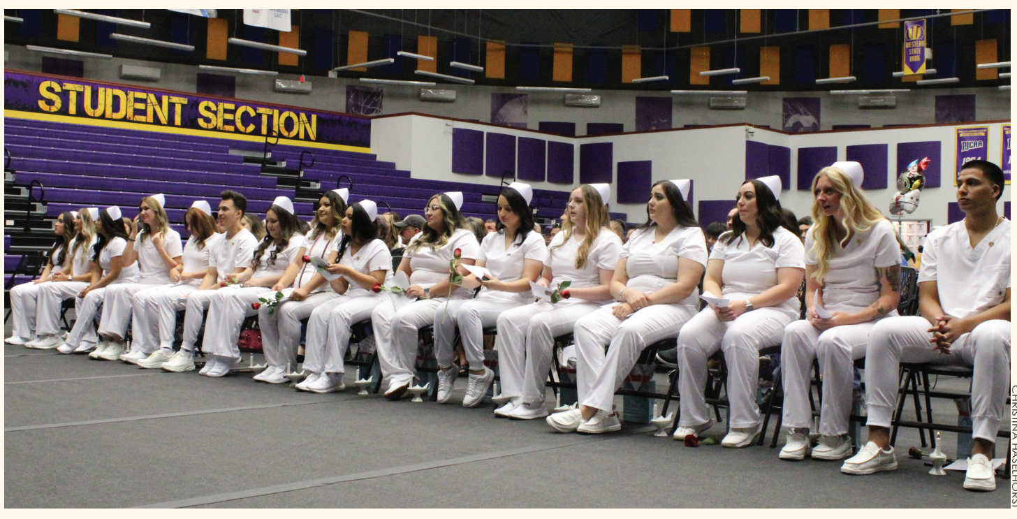
After receiving their pins, nursing students await the recessional lineup at the 2023 Nursing Pinning ceremony.