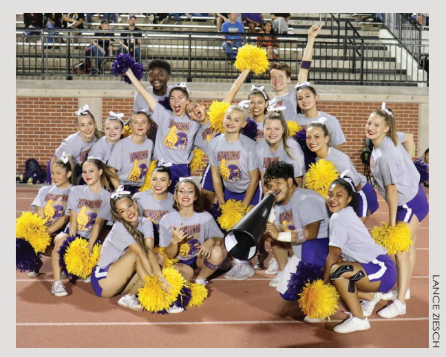
Members of the DC3 cheer team pose for a quick photo during the Homecoming game on Sept. 30.