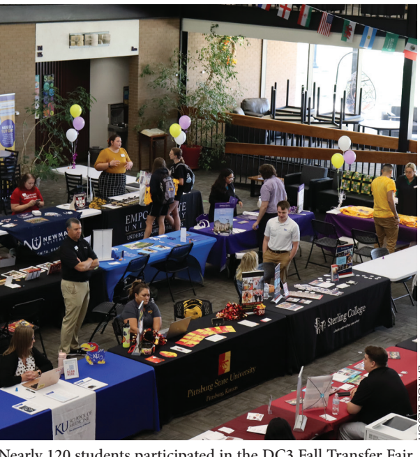
Nearly 120 students participated in the DC3 Fall Transfer Fair, from 9 a.m. to 1 p.m., on Sept. 7, in the DC3 Library. The fair, which is designed to help students explore their options after DC3, featured representatives from 29 four-year colleges and universities from around the state of Kansas, as well as schools from Arizona, Oklahoma, and Texas. In addition to free snacks and water, the first 100 students also received free T-shirts.