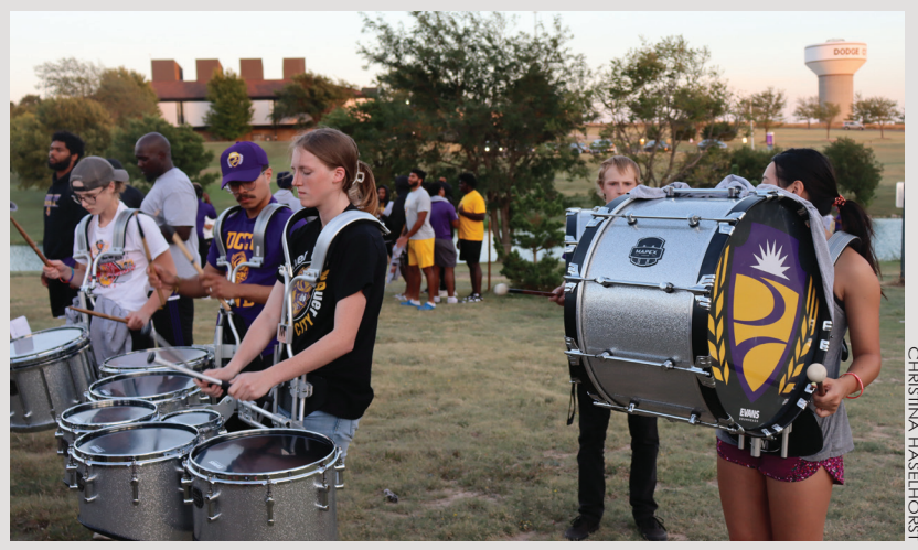
Members of the DC3 Pep Band perform during the bonfire and pep rally on Sept. 29.