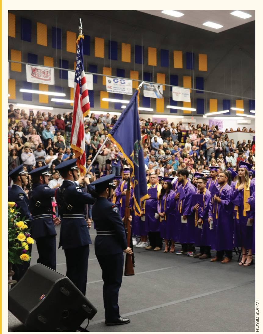
Above, members of the Air Force Junior Reserve Officers' Training Corps (Air Force JROTC) Color Guard at Dodge City High School present the flag at the 2023 graduation ceremony.