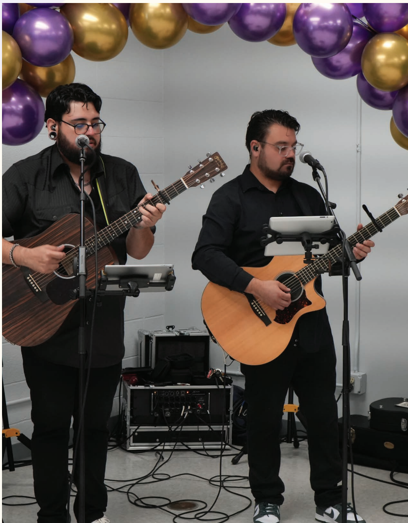
Them Spicy Boys provided live entertainment during the “DC3 Through the Years” history event on Friday, Sept. 26, in the Communications Center.